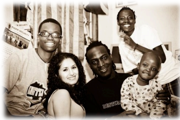
Members of Point Youth Media